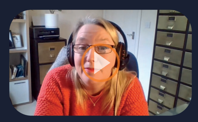
Capita celebrating International Women's Day

Engage talent pools of diverse candidates, through influential content and the promotion and celebration of inclusivity and human rights.