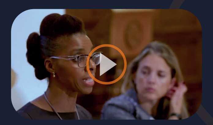
Challenging bias and driving awareness of the value of career returners and returnship programmes. A collaboration between IGA and an industry body.

Lead the debate and challenge the norm within your sector. Speaking out against key issues and be an enabler of change.