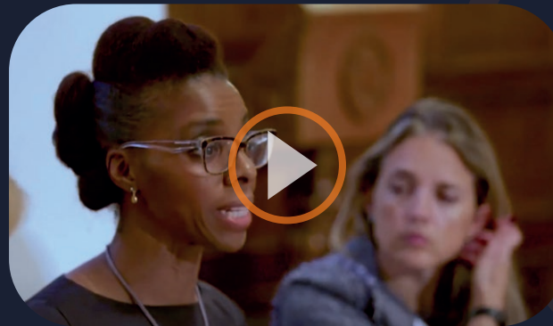
Challenging bias and driving awareness of the value of career returners and returnship programmes. A collaboration between IGA and an industry body.

Lead the debate and challenge the norm within your sector. Speaking out against key issues and be an enabler of change.