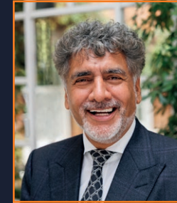
JAMES CAAN CBE Chairman