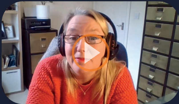
Capita celebrating International Women's Day

Engage talent pools of diverse candidates, through influential content and the promotion and celebration of inclusivity and human rights.