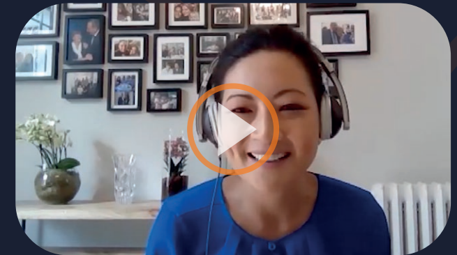
Deloitte, Inclusion Pledge events outlining D&I priorities, sharing recruitment experiences and how it feels to work at Deloitte

Your supply chain are the advocates of your employee value proposition. Are they educated? Are they aligned to your objectives?